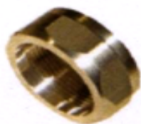
Matica Femmina Female